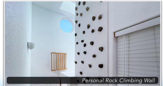
Personal Rock Climbing Wall