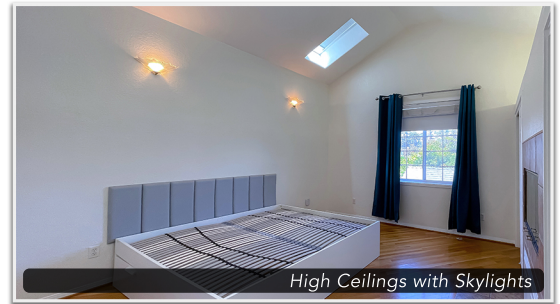
High Ceilings with Skylights