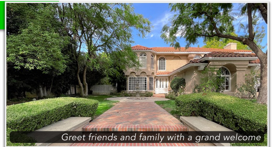
Greet friends and family with a grand welcome