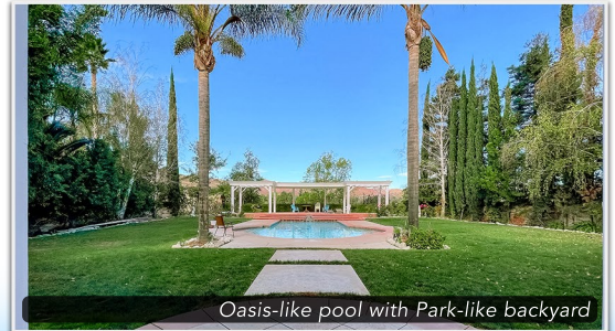
Oasis-like pool with Park-like backyard