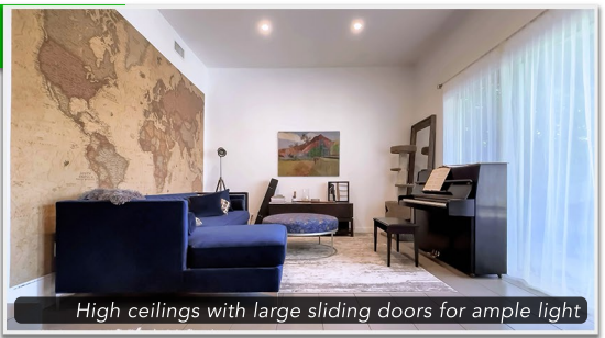
High ceilings with large sliding doors for ample light

Welcome to your Private Oasis with Newly Done ADU with its own address! Very chic contemporary with many upgrades done right all located in the heart of Mar Vista. Live the green life with your Solar System and Tesla charger or walk to nearby public transportation to the beach, Downtown Culver, or DTLA. This home is accented with character and creative touches at every turn. Light-filled oversized windows, glass wall dining room, and unique touches abound. Once home, enjoy your staycation with the professionally landscaped backyard with a relaxing hot tub. Entertain and dine in your home-grown garden with lemons, avocados, and more. Live close to restaurants, shopping, boating and and nearby beautiful beaches!